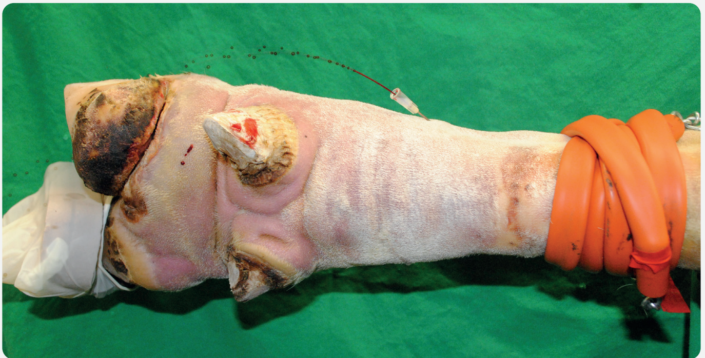
Figure 3: Intravenous regional anaesthesia on the hind limb of a Simmental cow. After applying a rubber tourniquet (Esmarchschlauch), a superficial toe vein is punctured and 20 to 25 mL of a 2% procaine hydrochloride solution is injected.

After allowing some blood to escape through the cannula, inject (without prior aspiration) 20 to 25 mL of a 2% procaine hydrochloride solution WITHOUT a vasoconstrictor agent. The tourniquet should be removed after 90 minutes. 34